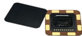
A TrustedBio module, showing the sensor surface (left) and, on the reverse side (right), our ASIC and connection circuits

The capacitive sensor in a TrustedBio module is covered by a robust, protective coating, allowing for years of usage. IDEX's bendable sensor is relatively inexpensive to manufacture and allows for an approximately 90 square millimeter sensor surface area, which is more than twice the size of competitive silicon sensors. The size of the silicon chip (ASIC) within IDEX's sensor is not directly related to the size of the sensor itself, which means that IDEX uses less silicon in the design for a given sensor size. In addition to this, IDEX uses high volume, mass-market, industry standard package technology to maintain cost-effectiveness. The capacitive sensor in a TrustedBio module produces a larger image, yielding more data, which IDEX believes enables superior scanning, feature extraction, and matching performance. Silicon-based sensors can have higher electrode density, but their smaller sensor areas yield meaningfully less data for image processing, while increasing processing challenges to achieve equivalent results. Additionally, bendable property of the polymer substrate allows the TrustedBio module to meet industry specifications for torsion of smart cards.